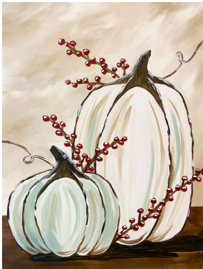
16 x 20 Canvas $25

Friday, October 21 6:00 – 9:00 PM INVITE YOUR FRIENDS!