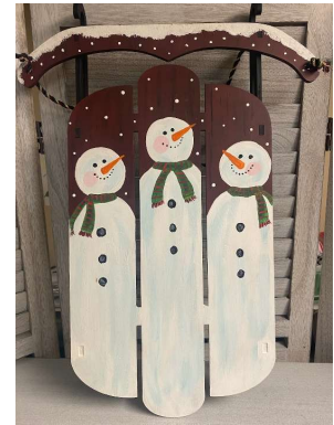
Wood Sled 18 x 9 Inch $35

Friday, October 21 6:00 – 9:00 PM INVITE YOUR FRIENDS!