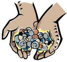
The Noisy Offering

The Noisy Offering is collected on the second Sunday of each month. This offering is part of “Two Coins a Meal” that funds hunger programs locally and around the world.