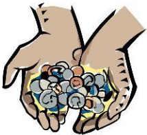
The Noisy Offering