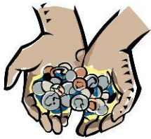
The Noisy Offering