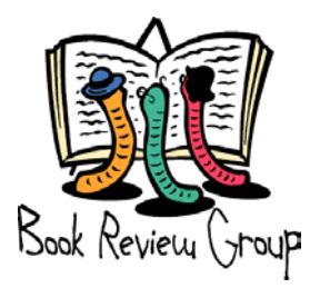
Book & Breakfast Club meets at 9:30 AM on the first Friday of the month at Liberty Restaurant on Pierson Road. All are welcome!