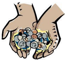
The Noisy Offering