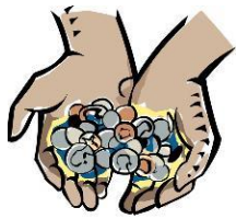
The Noisy Offering

The Noisy Offering is collected by the children of the congregation on the second Sunday of each month. This offering is part of “Two Coins a Meal” that funds hunger programs.