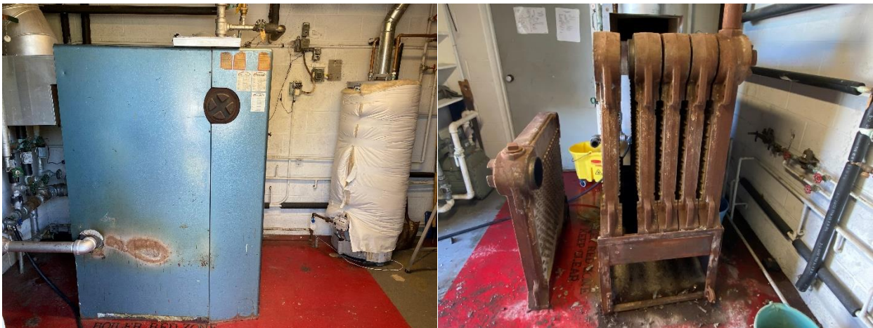
Old Boiler from 1950's & Hot Water Heater