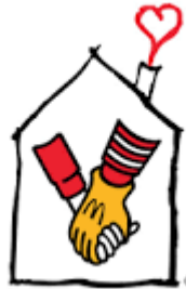
Ronald McDonald House

The Prayer Shawl Group meets at the church at 10:00 AM on the first Wednesday of each month.