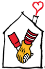
Ronald McDonald House

The Prayer Shawl Group meets at the church at 10:00 AM on the first Wednesday of each month.