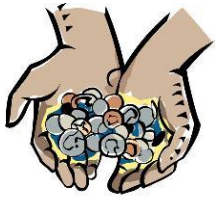
The Noisy Offering