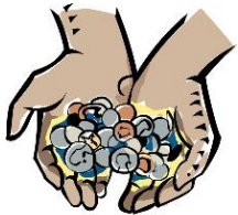
The Noisy Offering