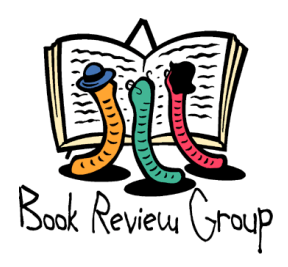
Book & Breakfast Club meets at 9:30 AM on the first Friday of the month at Liberty Restaurant on Pierson Road. All are welcome!