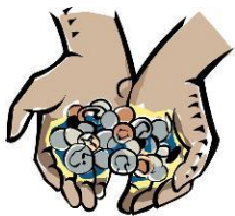
The Noisy Offering