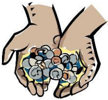
The Noisy Offering