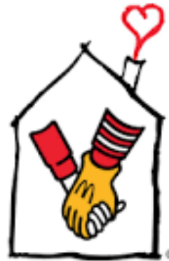
Ronald McDonald House

The Priscilla Circle meets at the church at 1:00 PM on the fourth Thursday of each month for fellowship and study. All women are invited to attend.