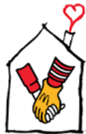
Ronald McDonald House

The Prayer Shawl Group meets at the church at 10:00 AM on the first Wednesday of each month.