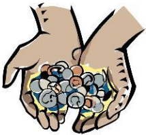
The Noisy Offering