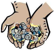
The Noisy Offering