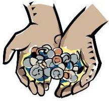
The Noisy Offering

The Noisy Offering is collected on the second Sunday of each month. This offering is part of “Two Coins a Meal” that funds hunger programs locally and around the world.