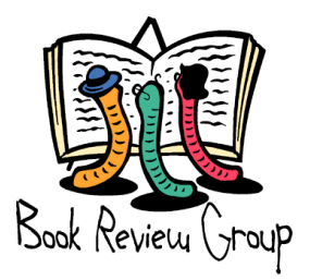
Book & Breakfast Club meets at 9:30 AM on the first Friday of the month at Liberty Restaurant on Pierson Road. All are welcome!