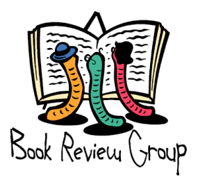
Book & Breakfast Club meets at 9:30 AM on the first Friday of the month at Liberty Restaurant on Pierson Road. All are welcome!