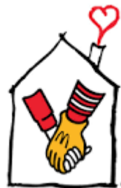
Ronald McDonald House

The Prayer Shawl Group meets at the church at 10:00 AM on the first Wednesday of each month.