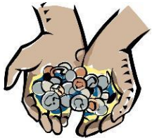
The Noisy Offering