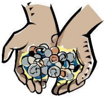
The Noisy Offering