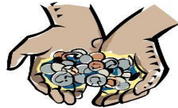
The Noisy Offering

Soup Kitchen... Volunteers work at the North End Soup Kitchen in Flint on the second Tuesday of each month, from 9:00 AM – 1:00 PM.